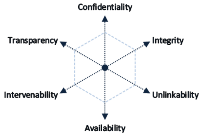
Fig. 2. Protection Goals

integrity and (3) confidentiality. 3 Building on this framework, three additional data protection specific protection goals were formulated: (4) unlinkability, (5) transparency, (6) intervenability.